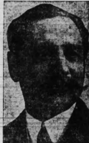
Senator Casgrain is sponsoring a bill designed to strengthen prohibition, by refusing manufacturing licenses in dry provinces.